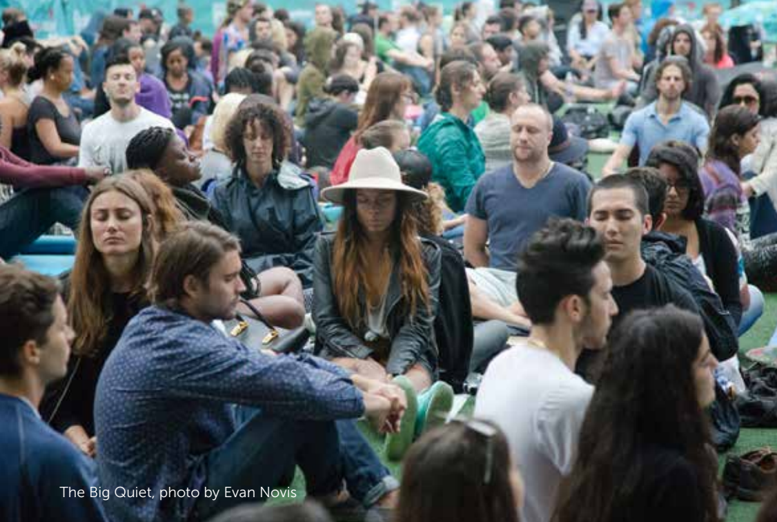
The Big Quiet, photo by Evan Novis

The Big Quiet , a brief group meditation session held in New York's Central Park, drew a crowd of over 1,000 in its first year. Five minutes of instruction were followed by 15 of stunning quiet, and then—more than an hour of dancing to soul and afro-Cuban beats.