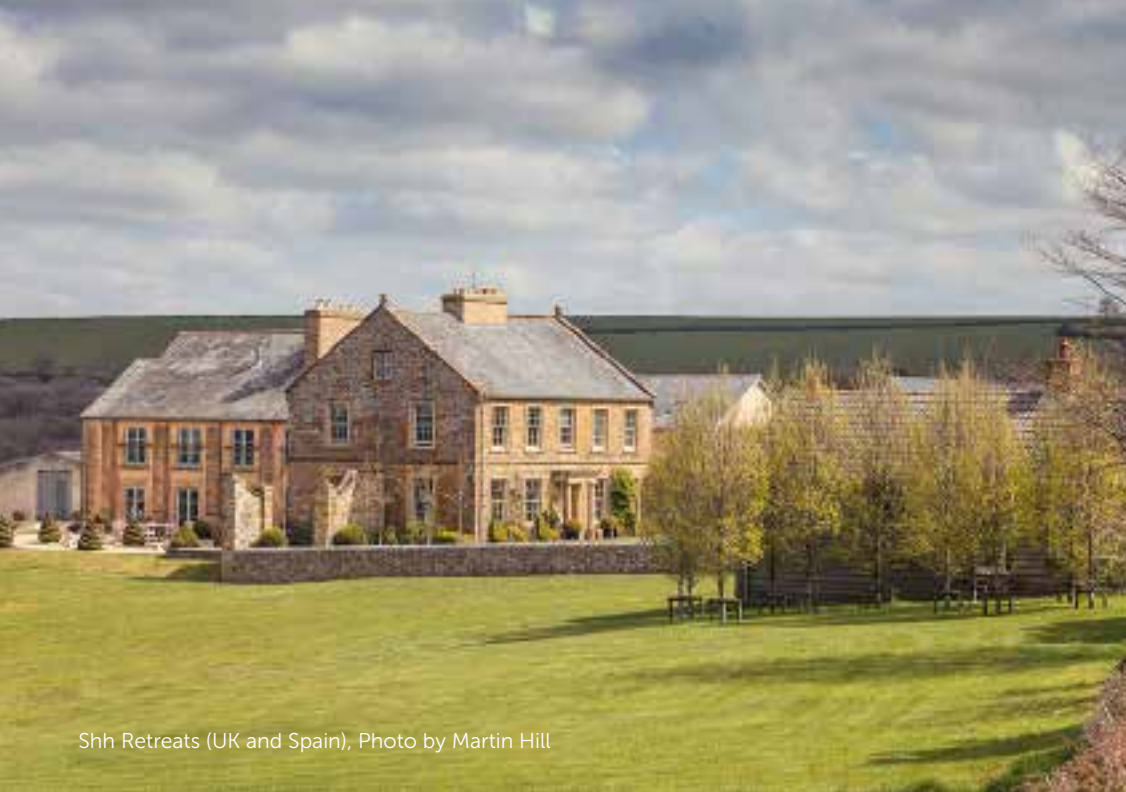
Shh Retreats (UK and Spain)

Shh Retreats , held in gorgeous country estates in the UK and Ibiza, Spain (and reportedly coming soon to the U.S.), are women's-only retreats, led by a team of practitioners (from sex therapists to pelvic floor health specialists) that take a no-holds-barred dive into improving women's libido and sexual pleasure.