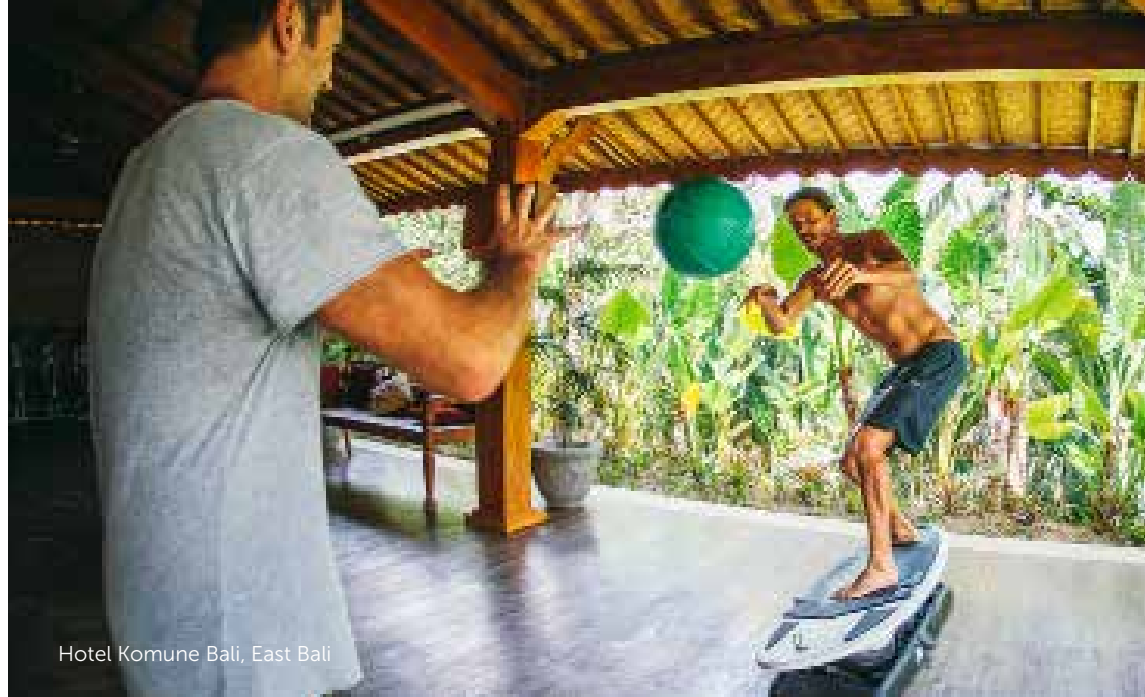
Hotel Komune Bali, East Bali

Hotel Komune's flagship Hotel Komune Bali represents the most evolved example of the surf-meets-wellness trend, marrying destination spa levels of wellness and fitness activities with one of the world's best surf breaks at Karamas Beach.