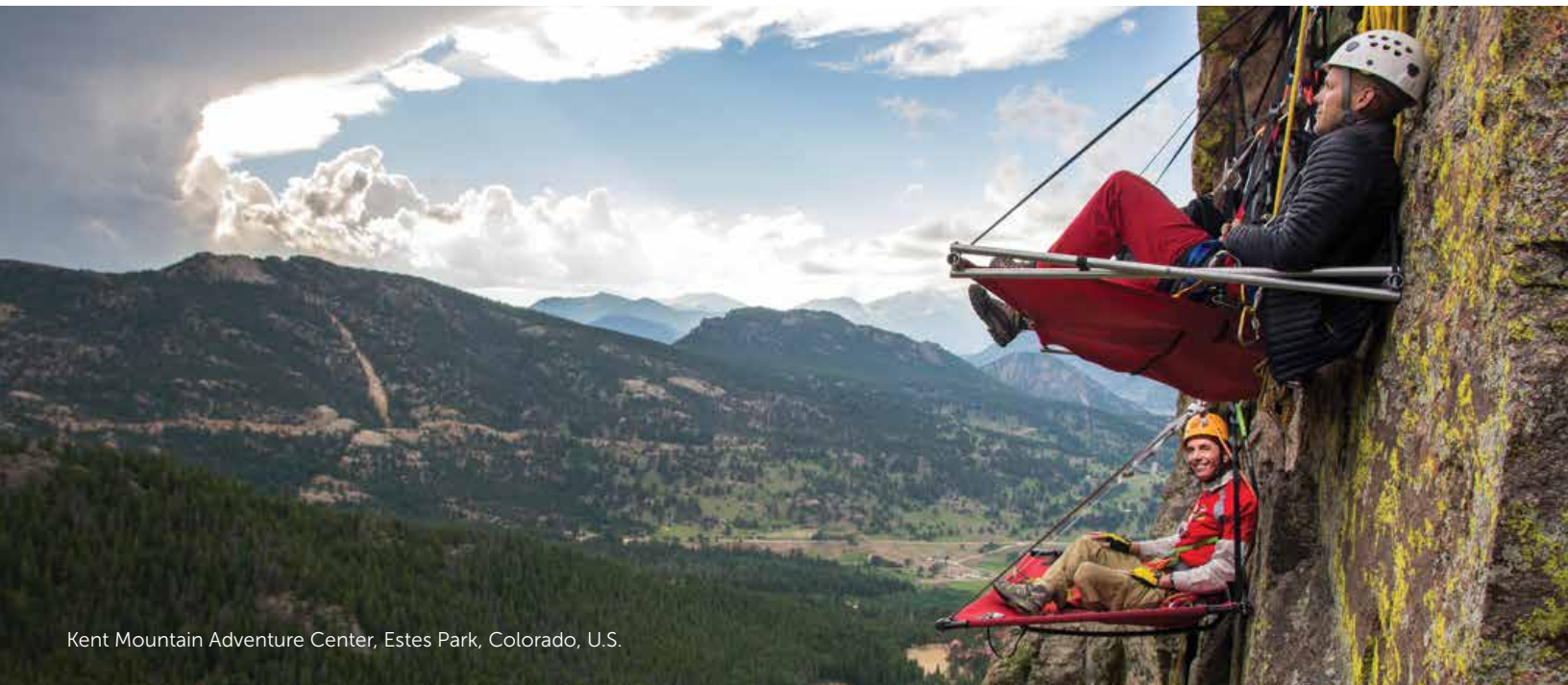
Kent Mountain Adventure Center, Estes Park, Colorado, U.S.

The most extreme wilderness experience may be cliff camping.