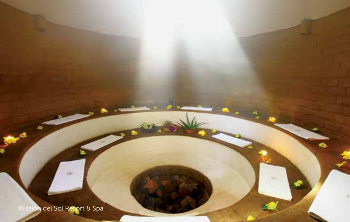
Mission del Sol Resort & Spa

Modern Temazcals may have special seating areas but traditional seating is on the earth floor on the Petate (a mat woven from the fibers of the palm), with the fire pit in the center.