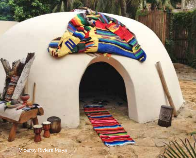
Viceroy Riviera Maya