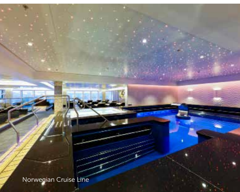
Norwegian Cruise Line

Additionally, travelers will find a lavish Canyon Ranch SpaClub aboard the equally luxurious Regent Seven Seas Cruise ship, Seven Seas Explorer , which will sail its maiden voyage July 2016. Spa-goers will enjoy exclusive treatments developed by Canyon Ranch in collaboration with Red Flower; the menu of offerings—which draw inspiration from the seven seas of the modern world, with names like Red Flower Japan: A Revitalizing Ritual of the North Pacific and Red Flower North Atlantic Journey—is expected to expand across the fleet. Adding to the allure: hot and cold experiences, an infinity-edge plunge pool, chroma-therapeutic shower, private outdoor deck, full-service salon, and circular staircase that leads to the fully equipped fitness center.