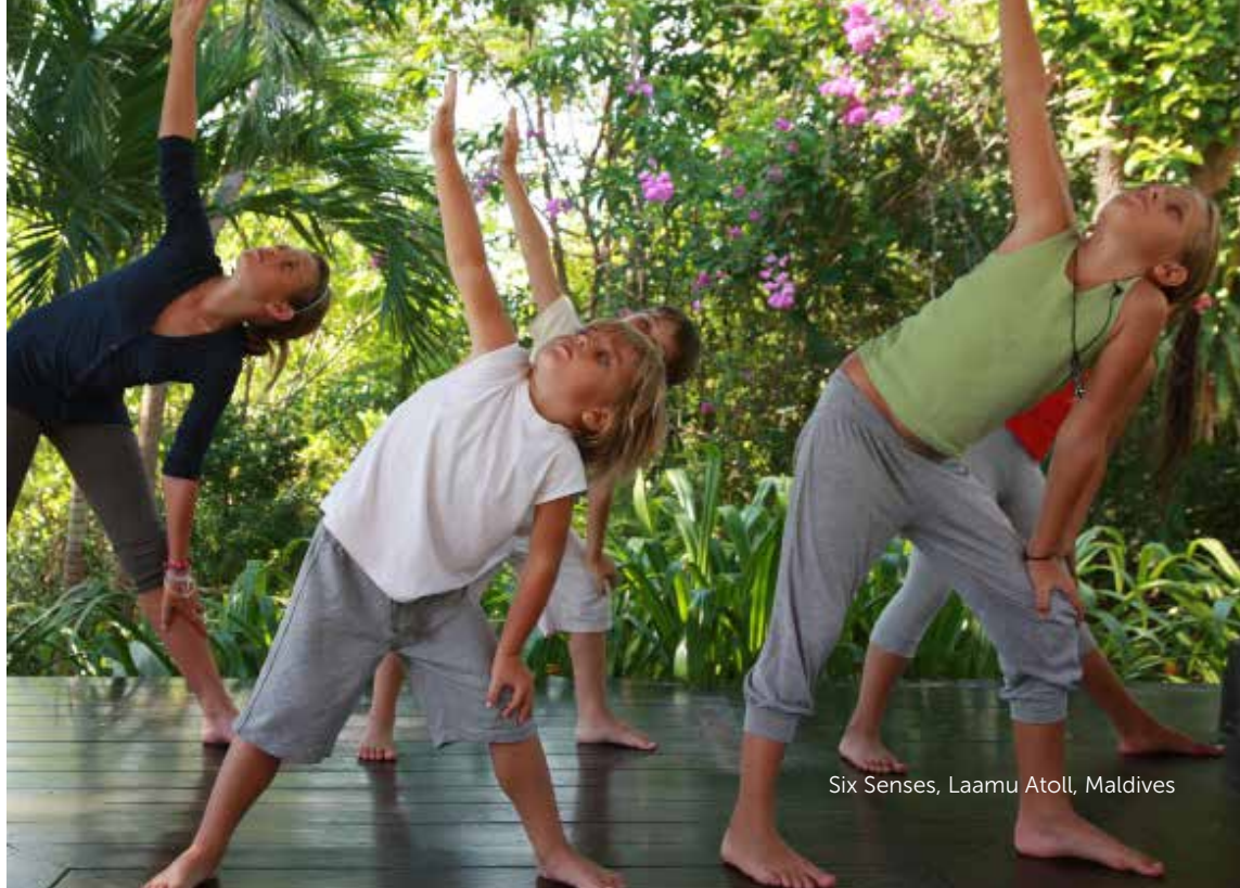
Six Senses, Laamu Atoll, Maldives

Yoga programs designed for children are offered in schools, community centers and wellness travel resorts around the globe.