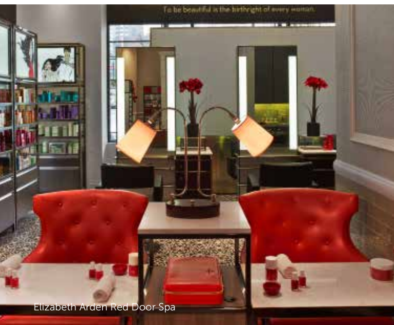
Elizabeth Arden Red Door Spa

Veluxe straddles the line between fitness and beauty, providing yoga and personal training on their list of services right alongside blowouts and updos. Even sports celebrities are getting in on the action, with tennis star Ana Ivanovic having recently launched the on-demand fitness app Trainers4Me to connect customers with personal trainers anywhere in the world. All of these apps provide customers with the opportunity for a guided, professional workout far from the noise and crowds that turn many off a trip to the gym.