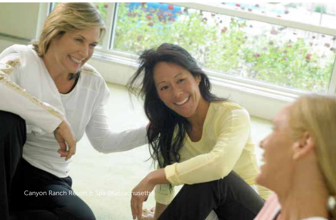
Canyon Ranch Resort & Spa (Massachusetts)

And for the “way out there” files, orgasmic meditation (or OM) has been making headlines for years and is now expanding globally. At inhibition-shattering OM centers, women (lying in blanket “nests”) have their clitoris stroked by an OM partner for 15 minutes “in a non-sexual way,” with the goal of expanding the concept of sex, and creating a more therapeutic, mindful practice around female orgasm. The leader