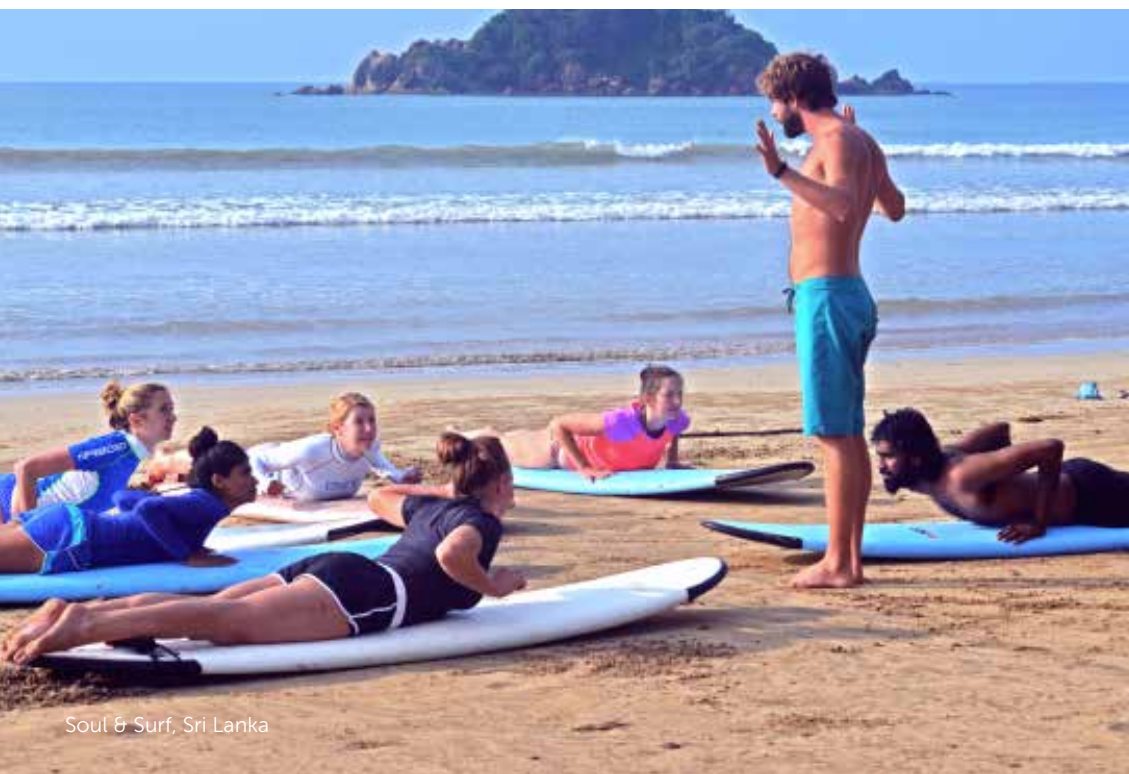
Soul & Surf, Sri Lanka

India: It's yoga central, but surfing? Yes. India boasts a vast coastline, and tropical Kerala, "the birthplace of Ayurveda", is surf central. One great property example: Soul & Surf, which combines expert surf lessons/tours with wellness "soul": sunset yoga, pranayama, meditation, massage, Ayurvedic consultations, and music programs—and with strong community "giving back," including a surf club for village kids. It nails the nice, affordable, unpretentious, and packed-with-wellness surf retreat trend, and has held pop-up retreats in Cornwall, UK. Soul & Surf is also building a new surf + wellness boutique jungle property in Sri Lanka.