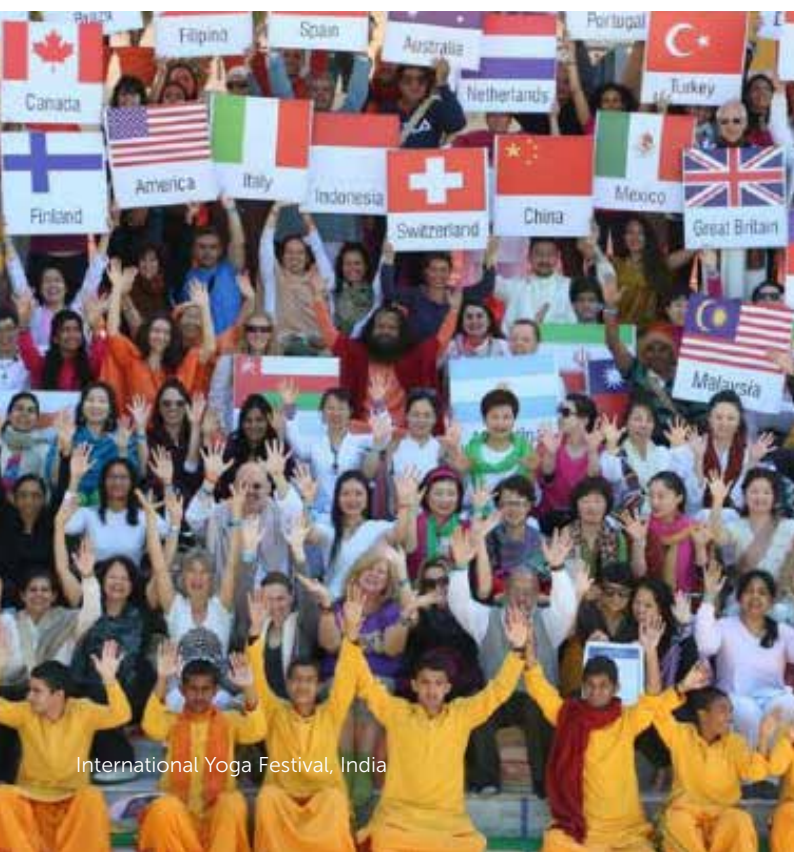
International Yoga Festival, India

The International Yoga Festival offers a week of yoga classes, sessions, and lectures, with thousands of attendees from over 60 countries.