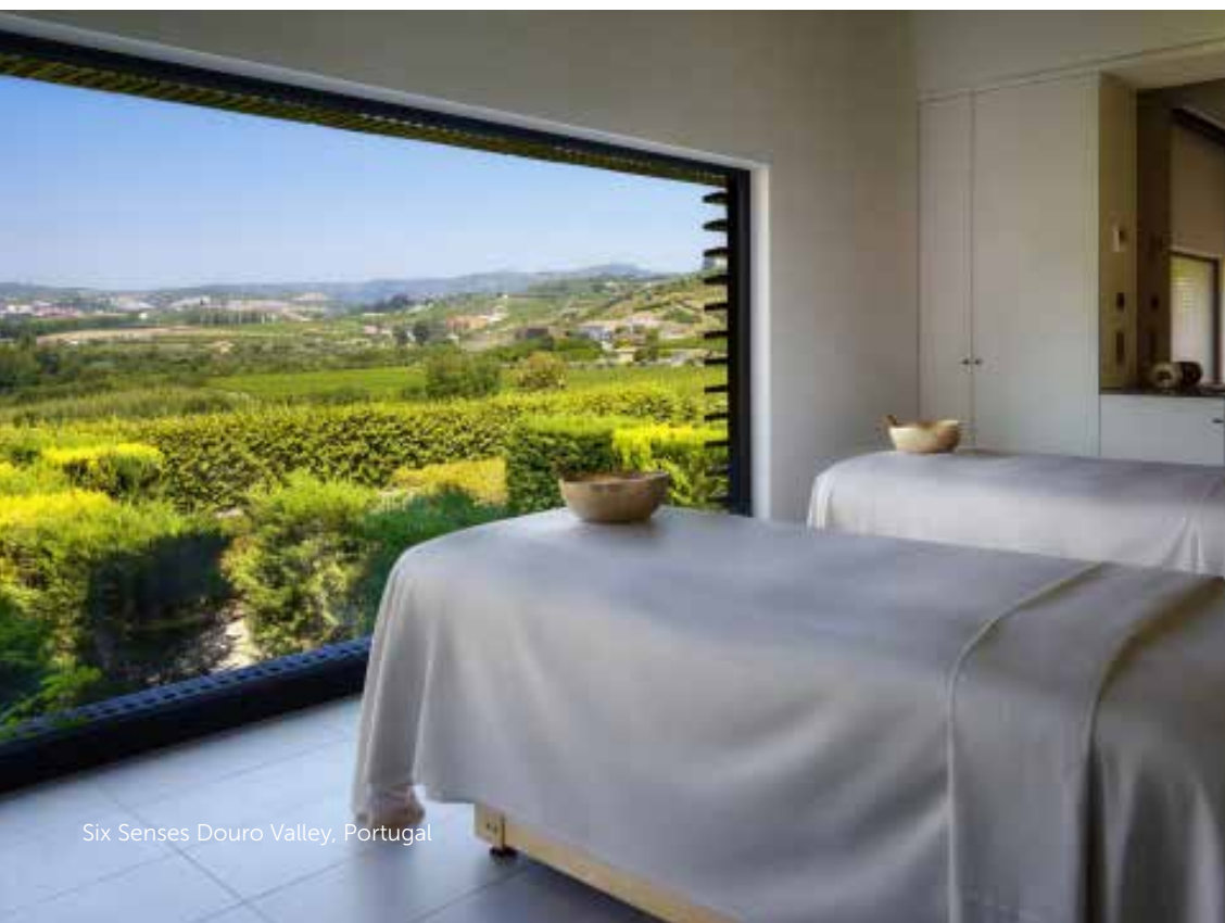
Six Senses Douro Valley, Portugal

Below are just a taste of examples and the trend's directions: from new properties striking the perfect balance between more extreme adventure and spa relaxation to established "mellow wellness" brands