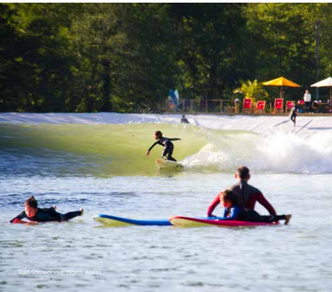
Surf Snowdonia, North Wales

Tooling down the California or Australian coast you see hordes of boys and girls in surf schools/gym classes. It's the new ballet class or tennis camp, and that will grow globally. More people will get introduced to