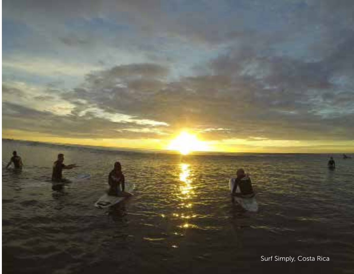
Surf Simply, Costa Rica

The all-inclusive Surf Simply (Nosara), takes surf coaching to another level for both beginners and the experienced—combined with yoga, massage and healthy meals.