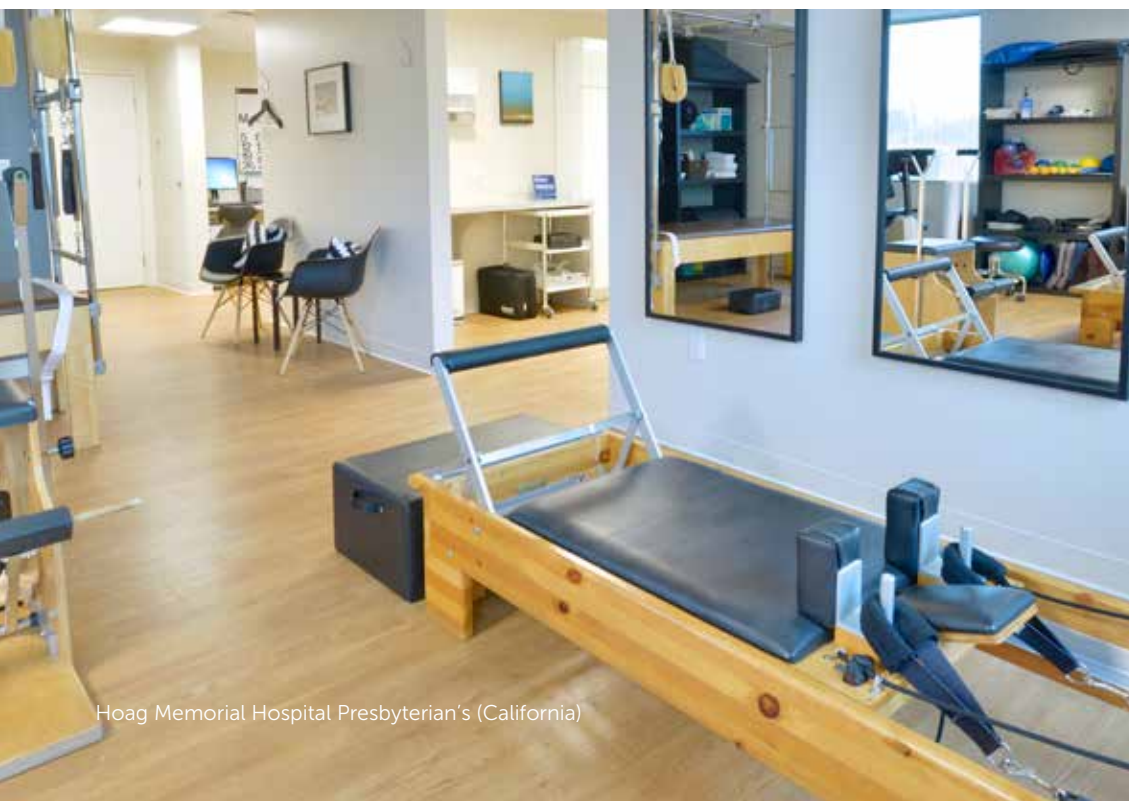
Hoag Memorial Hospital Presbyterian’s (California)