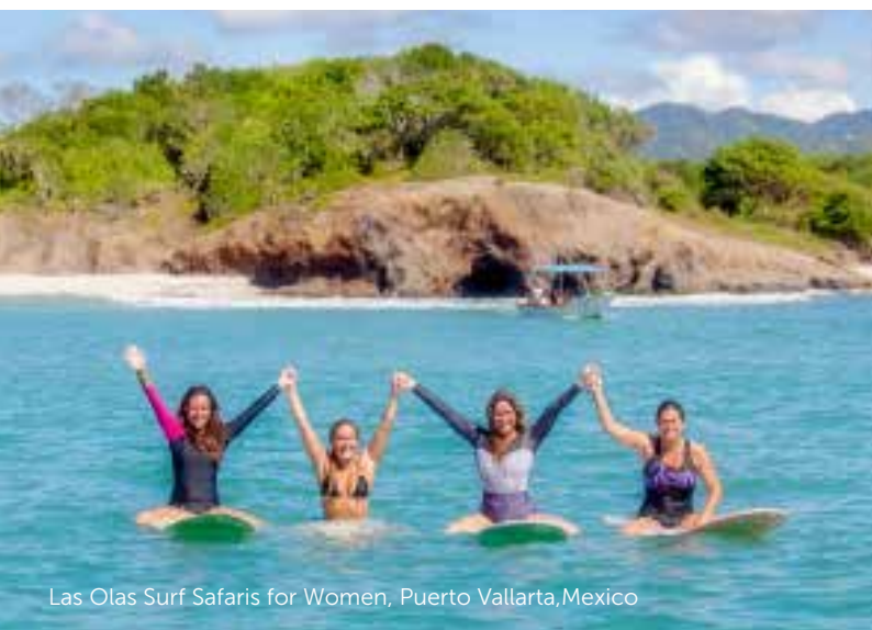
Las Olas Surf Safaris for Women, Puerto Vallarta, Mexico

The era of surfing as a Boys' Club is over, and many more resorts and camps are now focused on making surfing less intimidating for women/girls, with retreats typically blending a whole lot of yoga, healthy food, beauty, fitness, self-empowerment and social fun into the surfing mix. Unexpected brands are even getting into the women's surf + wellness retreat mix: trendy clothing company, Free People, this week launched FP Escapes at Xinalani Eco-Resort (Yelapa, Mexico) with surf classes, star yoga and healthy eating instructors, and women's empowerment workshops (Hawaii and Spain look to be their next destinations).