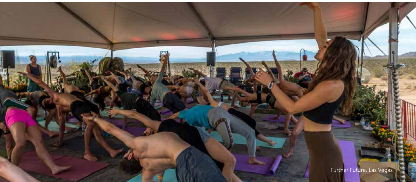
Further Future, Las Vegas

At last year's inaugural Further Future festival the amenities included a members-only spa, fine dining, and mini-TED talks on hacking your own consciousness.