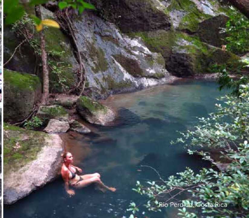
Rio Perdido, Costa Rica

Rio Perdido is an excellent example of new “Adrenaline and Zen” properties that blend big thrills and spa chilling. The mod-design, high adventure, and hot springs/spa playground is set on 600 acres of unspoiled nature in Costa Rica, a nation where rush and relaxation is its tourism brand.