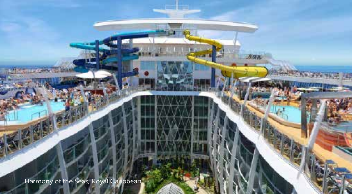
Harmony of the Seas, Royal Caribbean

Royal Caribbean's Harmony of the Seas targets younger cruise-goers with exciting elements such as rock climbing, zip lining, and multistory water slides.