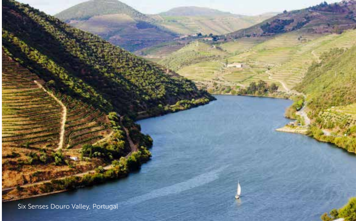
Six Senses Douro Valley, Portugal

The new Six Senses Douro Valley offers a high-flying tree climbing challenge and canyoning adventures, involving rappelling and ziplining down the wild River Cabrum Falls. It's a Six Senses property so stress-reducing spa/wellness therapies are a given.