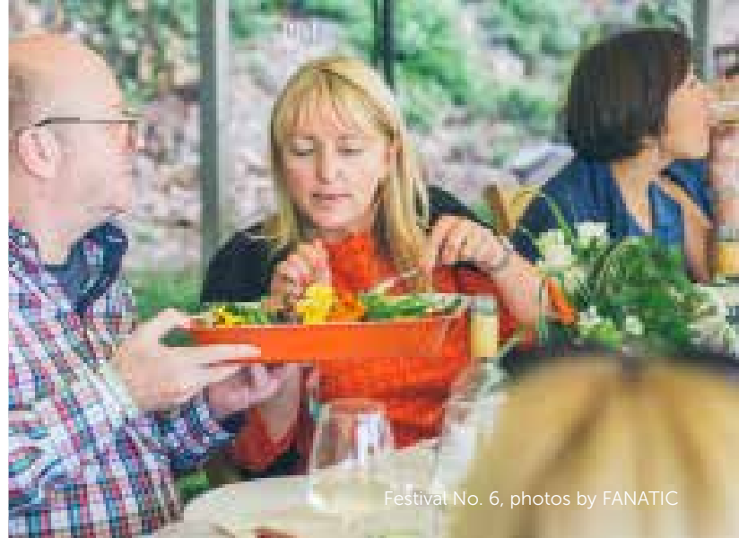
Festival No. 6

In the UK, Festival No. 6 celebrates every facet of dance music, from parties in the woods to big tent headliners, along with healthy food, arts and culture.