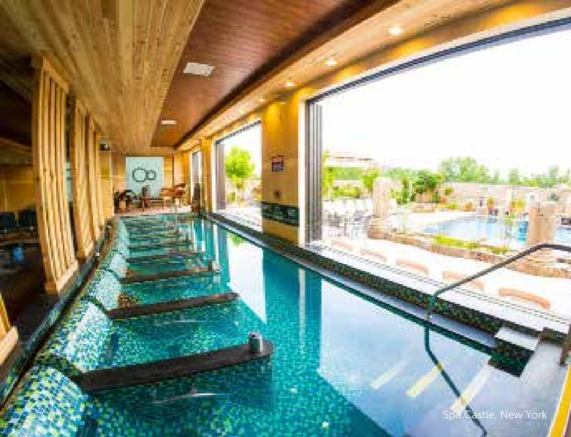
Spa Castle, New York

Affordable spa and beauty treatments at Korean spas (or jimjilbang) are popular with urbanites in Western cities. Revenues at Spa Castle in the U.S., sometimes described as the Disneyland of spas, were estimated to be more than $20 million annually in recent years. Many non-Koreans first experience Korean beauty approaches at a jimjilbang.