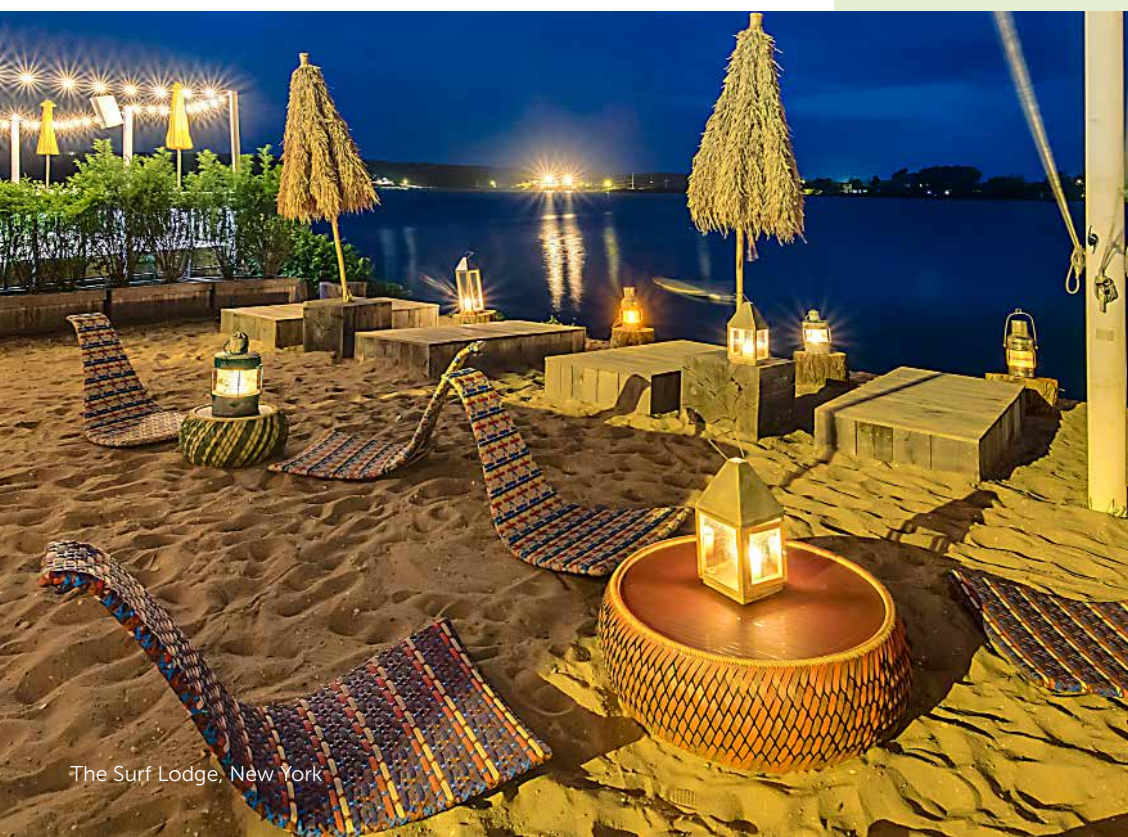
The Surf Lodge, New York

Surfing is hot on the "other" coast, from Maine to North Carolina. The Surf Lodge (Montauk, New York), combines farm-to-table cuisine, a roster of star-taught fitness classes and surf lessons.