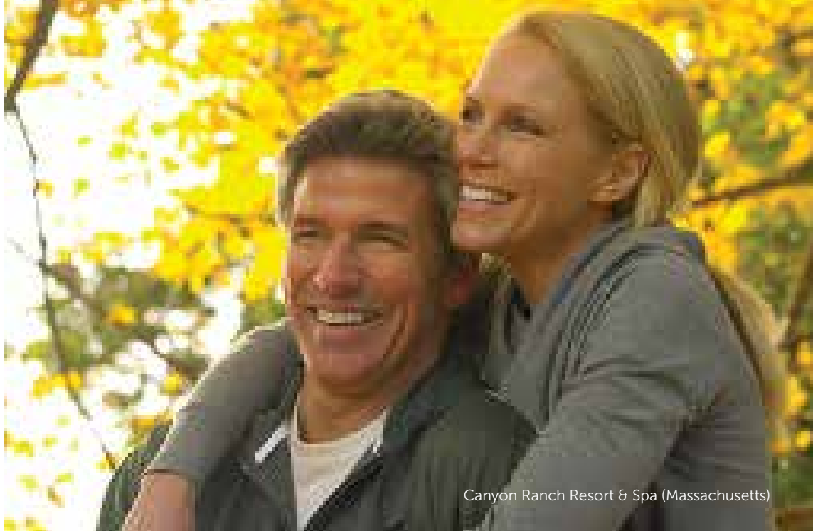
Canyon Ranch Resort & Spa (Massachusetts)

At the “Let’s Talk about Sex” event at Canyon Ranch Lenox , couples learn how to enhance or reinvigorate their sexuality with advice from experts.