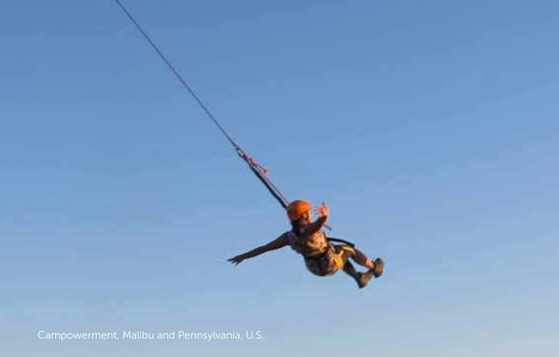
Campowerment, Malibu and Pennsylvania, U.S.

Campowerment is one of the new “adult sleepaway” camps, where women face challenges like high ropes courses, ziplines and Tarzan swinging. It’s all about the blend of adrenaline (from team war games to wild drumming workshops) and de-stressing with massage, meditation and yoga.