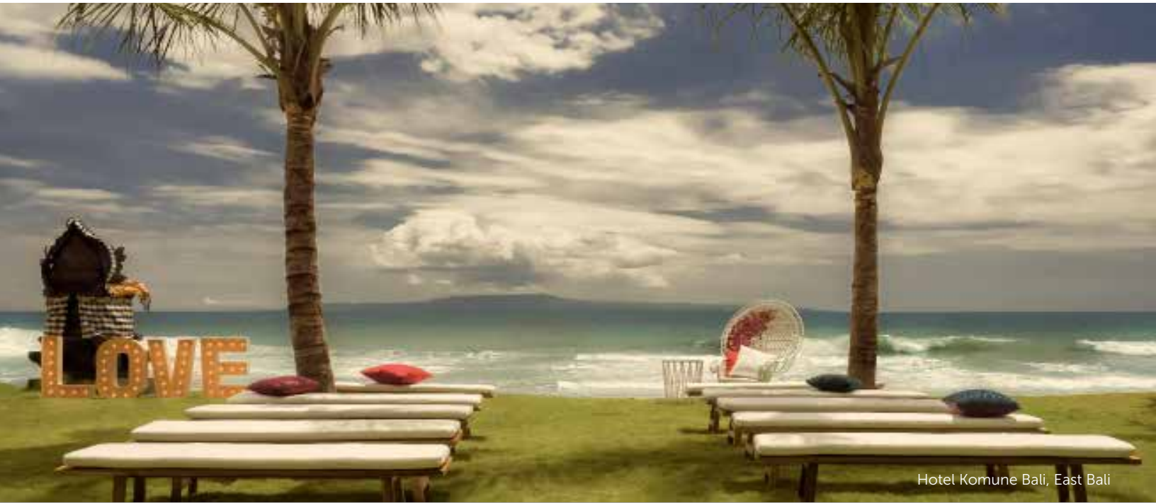
Hotel Komune Bali, East Bali

“Let’s go surfin’ now, everybody’s learning how, come on a safari with me.”