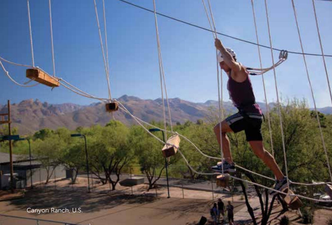
Canyon Ranch, U.S.

Spas like Canyon Ranch are using high-adrenaline challenges as a way of overcoming fears, letting go of bad “baggage,” and jumping into a healthier future. Tourists from the most stressed, vacation-starved nations (like the U.S. or Asian countries) crave the adventure and relaxation cocktail most.