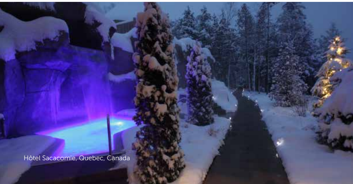
Hôtel Sacacomie, Quebec, Canada

At Hôtel Sacacomie guests can try James-Bondesque “ice driving,” and take a Porsche (with studded tires) out for a 150 mph spin across a frozen lake (along with dog-sledding and snow tubing) and then hit the toasty Geos Les Bains spa with underground saunas and steam baths.