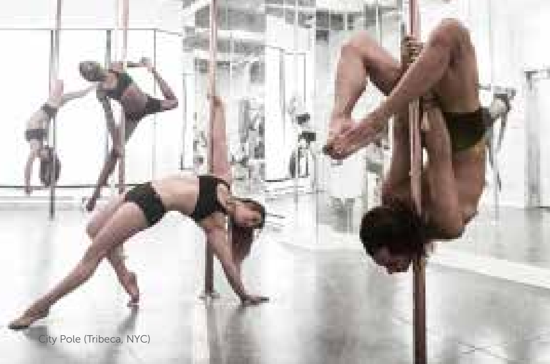
City Pole (Tribeca, NYC)

Sensual fitness classes like pole dancing are trending towards a classier “true wellness” vibe like at the new City Pole .