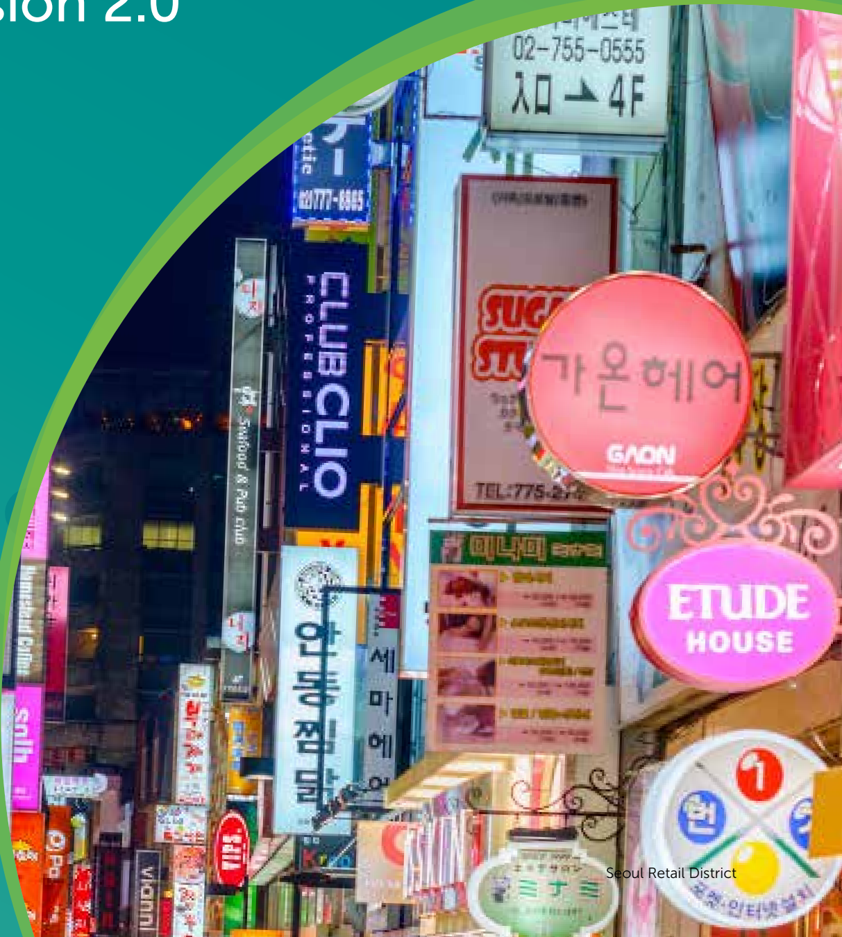
Seoul Retail District

Leading Korean companies launch 20 to 30 products per month. Compare that to Western brands, which release ten to 30 per year.