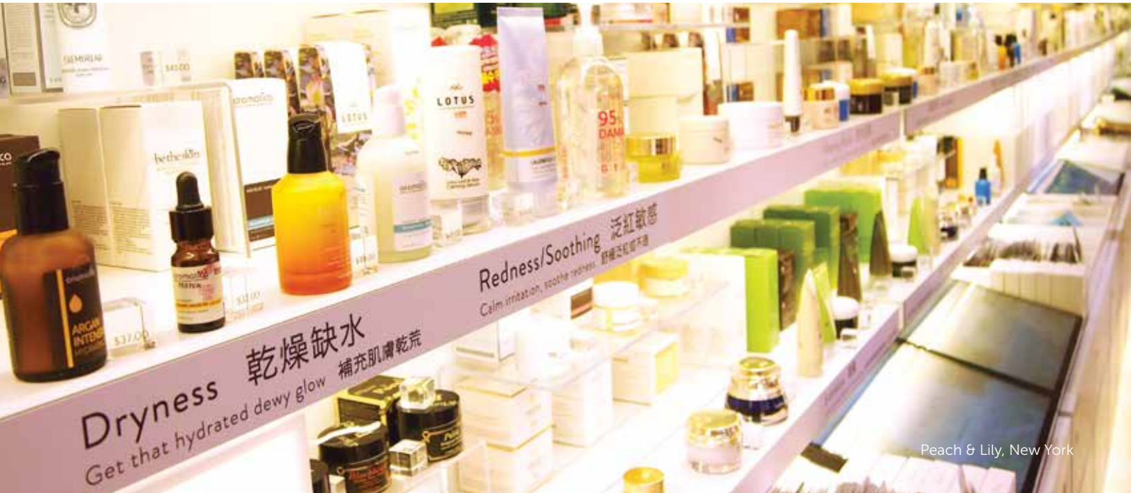
Peach & Lily, New York

Two life-size cardboard cutouts of fresh-faced and stylishly coiffed South Korean boy band stars welcome guests at the entrance of Nature Republic's downtown Los Angeles store. But Nature Republic is not a music shop, or even a clothing brand. It's a major South Korean skin care and cosmetics line, one of many that is grabbing the attention of global style-watchers because of its quality, affordability, and colorful pop sensibility.