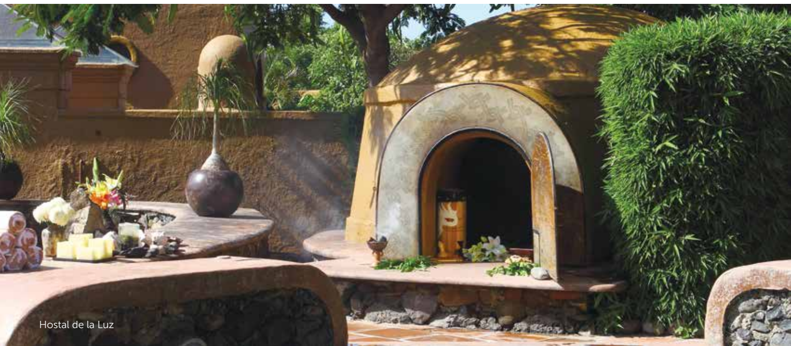
Hostal de la Luz

As the wellness-inclined increasingly look to the wisdom of the ancients to nourish their mind, body, and soul, Temazcal serves as a prime example of the blossoming interest in “indigenous spirituality.”