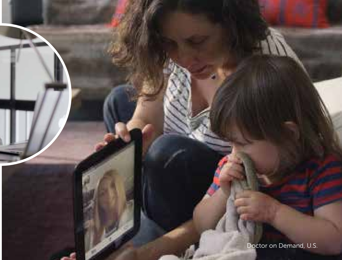
Doctor on Demand, U.S.

Doctor on Demand, backed by British mogul Richard Branson and co-founded by Dr. Phil's son Jay McGraw, provides at-home services in more than 46 states in the U.S.