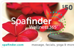
2014 Holiday plastic card