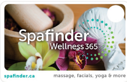
Canadian variable denom plastic card