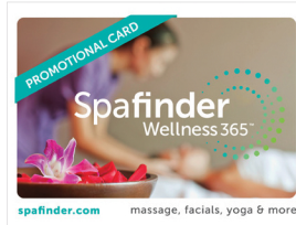
Promotional paper card