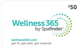
Wellness365 plastic card